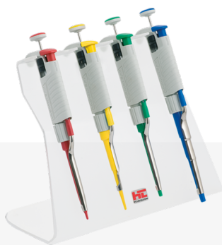
Plexi 4-position stand (Cat. No. 5480)