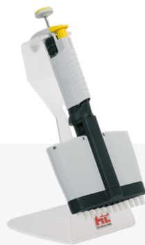
Plexi 1-position stand (Cat. No. 5479)