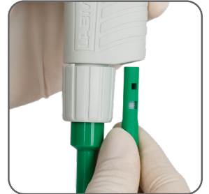
Adjustable ejector height system – to accommodate all brands of tips