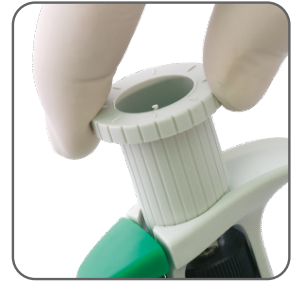
Easy user calibration