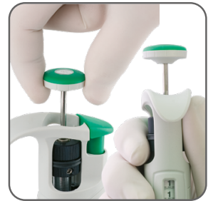
Dual volume setting using the pushbutton or the thumbwheel