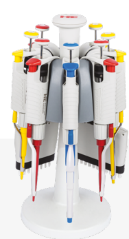
Multiple stand (Cat. No. 5449)