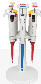
Carousel stand (Cat. No. 5484)